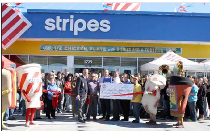
Stripes opened its second convenience store location in Portales at 18th and Avenue D. Officials from parent company Susser Foods were on hand Feb. 11 for the store's grand opening. The Portales Junior High band performed as well.